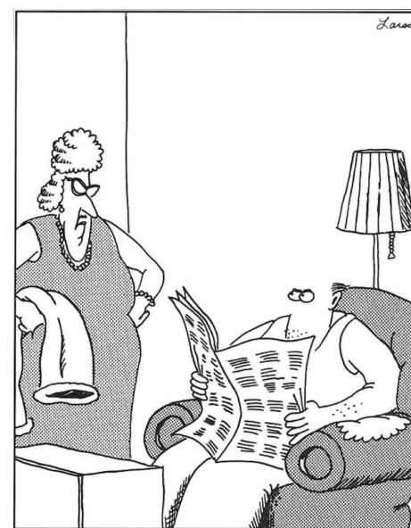
"For heaven's sake, Murray! ... We're supposed to leave in five minutes and you're not even drawn yet!"

Until next week - ka kite, Kerry Hawkins & staff